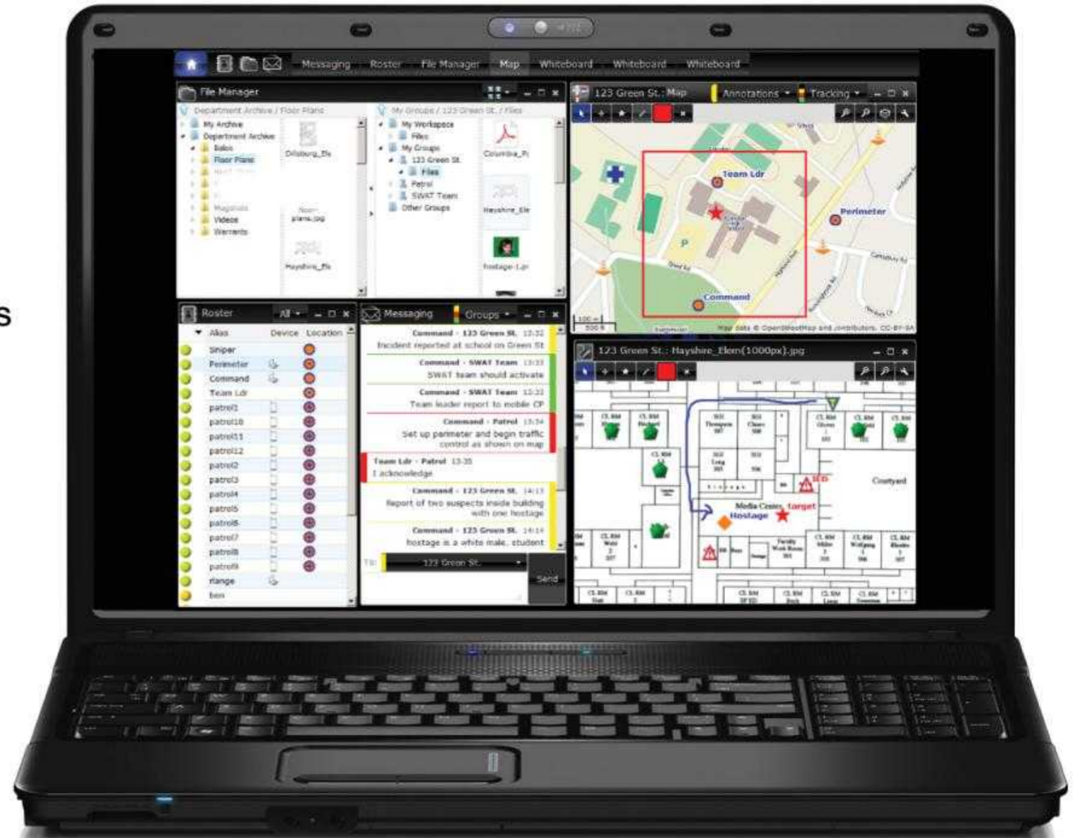
DragonForce Command Center for laptops & workstation browsers